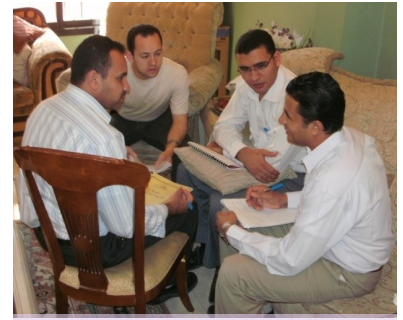
Students in small group discussion

Recently, two teams from PTEE traveled to two different countries in the Arabian Peninsula to offer a two-day tutor training seminars for Arab expatriate churches eager to invest in its leadership through theological education. Many church members are men who have come to the Gulf for work. Because of their employment status, these believers are separated from their families for long stretches of time. Recently-graduated tutors are already busy registering new students for classes. Upon completion of the tutor training seminar, one participant—a medical doctor who had previously taken PTEE courses in his home country—told the team: