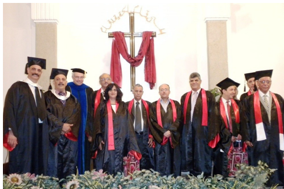
PTEE Graduation in Egypt 2010